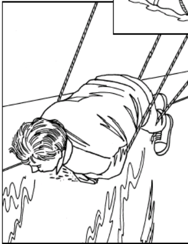
Figure 12.2: Parbuckling techniques