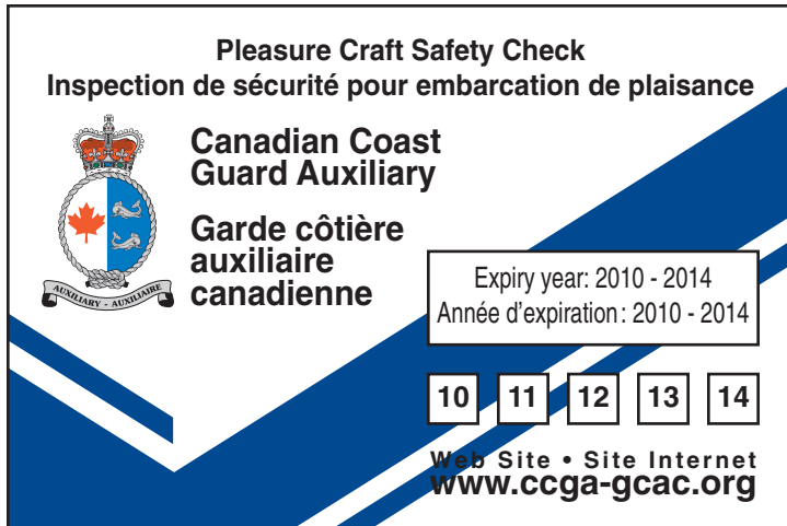
Form N° 1 / Blue PMS 280