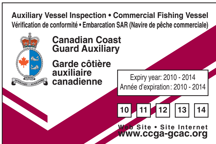
Form N° 3 / Burgundy PMS 208