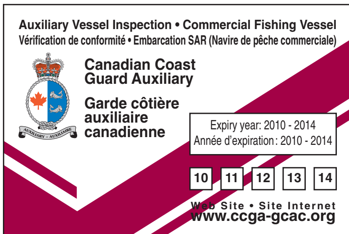
Form N° 3 / Burgundy PMS 208